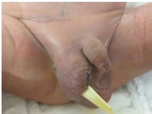
Fig. 3 Scrotum appearance after surgical exploration

Subsequently, the antibiotic regimen initiated on admission was continued to treat the urinary tract infection until the culture returned without bacterial growth. Later, voiding cystourethrography (VCUG) was performed, and with its results indicating no anatomical and structural abnormalities, the patient was discharged on day 12 of admission completely recovered and in healthy condition (Fig. 3).