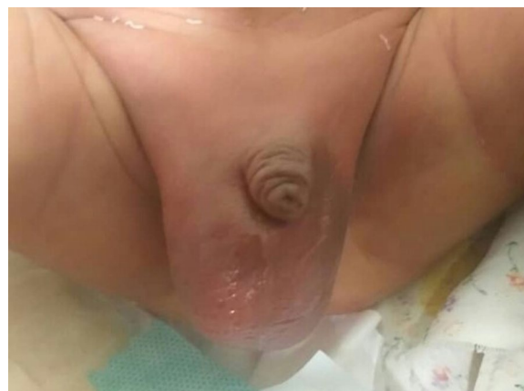
Fig. 1 Scrotum appearance on admission

The laboratory investigations revealed leukocytosis and elevated C-reactive protein (CRP) levels, meaning inflammation was present. Blood, urine, and cerebrospinal fluid