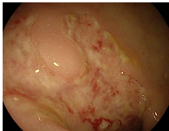
Fig. 1 Colonoscopy revealed several ulcerations in the sigmoid, rectum, and descending colon